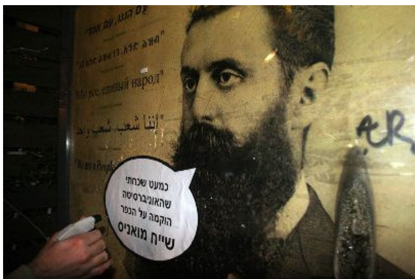
Herzl says: "I Almost Forgot – The University was built on the village of Sheikh Muwannis"