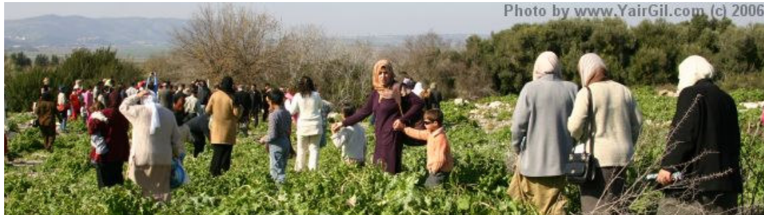
Ayn al-Mansi, 18 Feb. 2006 (Yair Gil)

Tours / Opposition to building plans / Official signposting of destroyed Palestinian villages / Commemorations / Nakba map in Hebrew / Map of the Palestinian villages in Tel Aviv / Travel guide / 60 years since the Nakba / Protest in response to JNF street installation / Protest against the war in Lebanon