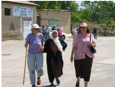
The women's group toured Amqa last May

For one of the conference in Israel Eitan Bronstein wrote a text about local opposition of Jewish people to the Nakba (Hebrew) . Requests to Zochrot to present at conferences evidence the growing awareness of Zochrot's work both at the academic level and at the organizational level in Israel and around the world. (This academic standing is also expressed in the many requests by students for information from Zochrot on topics related to the Nakba). The conferences also provide rare opportunities for Zochrot to be exposed overseas and to connect with different researchers and organizations that work along similar lines.