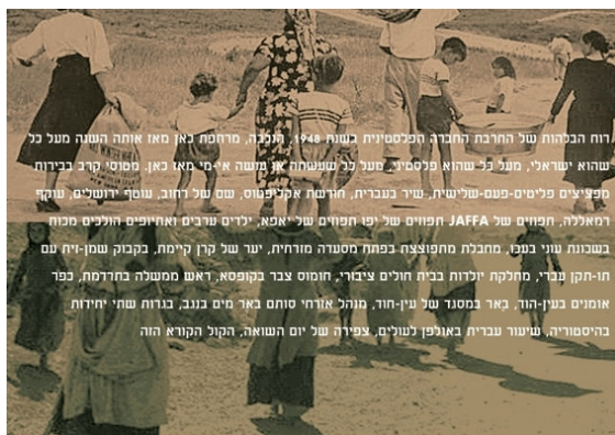
At left is the postcard that was sent out to invite contributions to the Magazine and Gallery. The upper photo shows new Jewish immigrants in Israel, while the bottom image shows expelled Palestinians making their way to Lebanon in 1948.