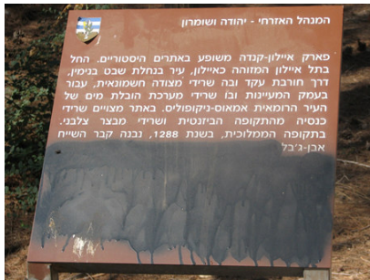
Zochrot photo (above) Text in black was painted over (right)

vandalism against official JNF signs reflects how much the act of signposting the villages touches on a raw nerve for Jews living in the country. These signs were posted by the JNF, not by Zochrot in some “extreme” act. The very fact of their existence on the landscape, of the reminder that there was Palestinian life before the Nakba, is what challenges Israelis.