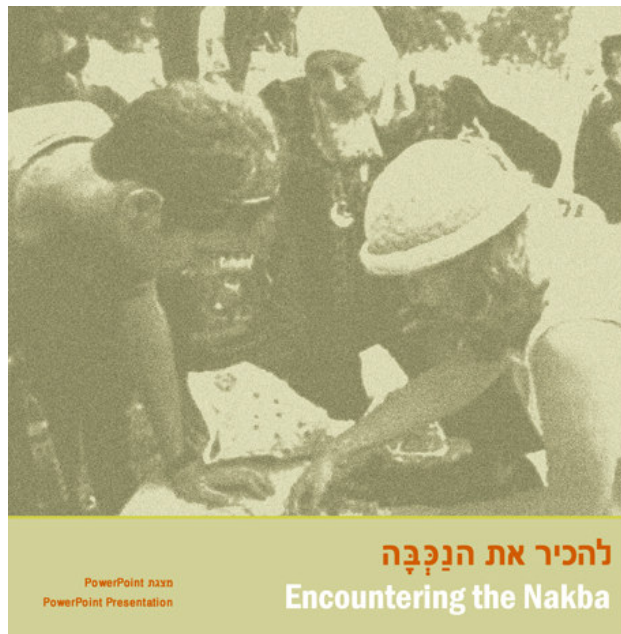
Cover of Nakba presentation CD

and under his direction the booklets have become more professional. Also, beginning with the Bir a-Seba booklet an effort has been made to translate at least half of the texts into English, whereas before the booklets were printed in Arabic and Hebrew only.