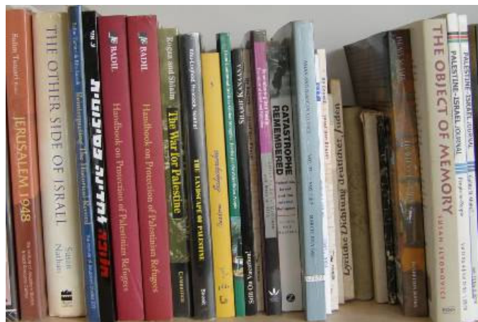
Titles at the Learning Center

Website / Learning Center and research guidance / Booklets / Nakba presentation / Visual materials / Testimonies and videos / Journal / Art gallery / Media