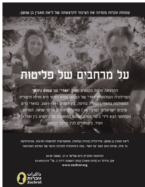
Flyer promoting an evening film-screening and lecture at the Learning Center